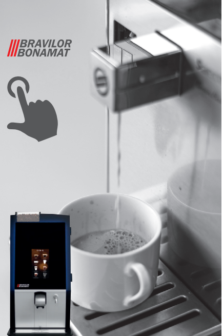
TABLE TOP & PUSH-BUTTON MACHINES