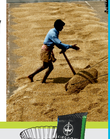
Size: 50 by 60g sachets (includes filter papers)

Countries of origin: Brazil/Central America/Ethiopia/Indian Robusta